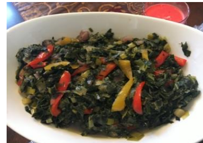
Sweet -n- spicy collards with red and yellow peppers, red onions, leeks, red pepper flakes, jalapeño (fresh), maple syrup.