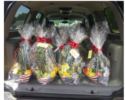
Caldwell sisters share their creative talents to help prepare ALM's gift baskets.