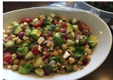
Garbanzo salad with diced avocado, cherry tomatoes, cilantro, diced cucumbers, feta