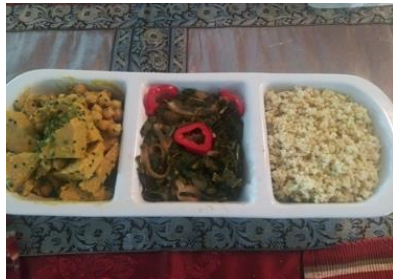
Millet, mandarin garbanzo tofu with sesame seeds, ribboned collard greens with onions