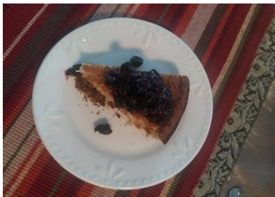
Coconut millet cheesecake