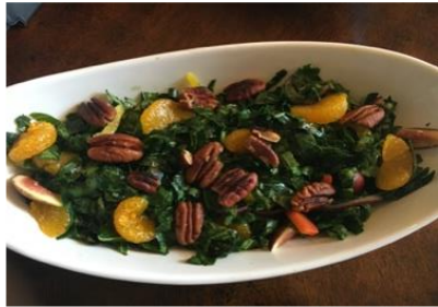
Collard greens salad with toasted pecans, thinly sliced red onions, mandarin oranges, julienne red and yellow peppers

ALM's Inaugural Flexible Foods Virtual Dinner Party was an opportunity for participants to prepare dishes incorporating seven (7) randomly selected ingredients from an alpha numeric coded list. ALL ingredients must be incorporated into their virtual dinner party menu. The randomly selected ingredients for the July 26 dinner party were mandarins, collards, ginger, figs, pecans, chickpeas/garbanzo beans, millet.